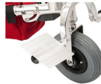
Foot Rest Support Plate