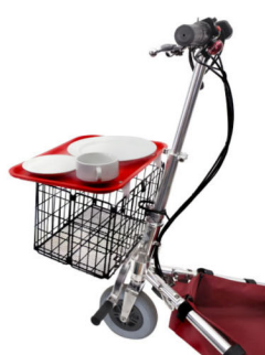
Cruise ship set