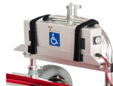
Auxiliary Battery Tray