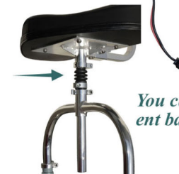
Suspension seat post