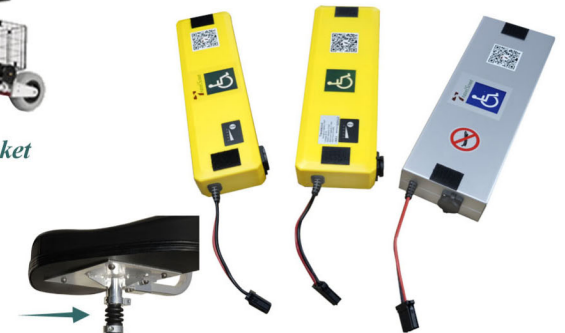
You can choose between 3 different battery sizes / ranges