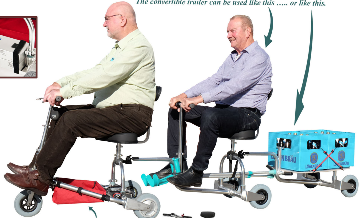
For light weight carry on luggage